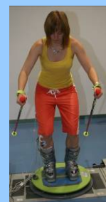
Figure 1 MFT S3 test

84 experienced skiers (ES) and 66 ski racers (SR) of the Skigymnasium Stams were tested two-legged with and without ski boots with the MFT S3 Test. The MFT S3 Test is a reliable and valid balance measurement system for performance and sensorimotor regulation during a lateral and a forward/backward test. The test system consists of an uniaxial unstable platform with an integrated sensor, which records all discrepancies in the horizontal plane. All fluctuations of the center of gravity are measured and transformed into stability, sensorimotor and symmetry indexes to define the individual state of balance. An index of 1.0 is perfect, and the index increases as the test deviates from perfect. In this study skiers were tested two-legged, with and without ski boots in the lateral setting (Figure 1). Testing time was 30 seconds for each trial. Additionally 10 ES underwent the same test with surface electromyography (EMG) to assess intermuscular activity of the M. peroneus brevis (PB), M. tibialis anterior (TA), M. gastrocnemius lateralis (GL), M. vastus lateralis (VL), M. biceps femoris (BF), M. obliquus externus abdominis (OE) and M. lumbar erector spinae (LES). EMG-data were recorded and processed with Noraxon MyoResearch 2000. For statistical analysis (SPSS 12.0, p < 0.05 ) a Kolmogorov-Smirnov-Test (examination of normal distribution), a dependent and independent t-test (to test for differences between the two test situations, skill levels and gender) were used.